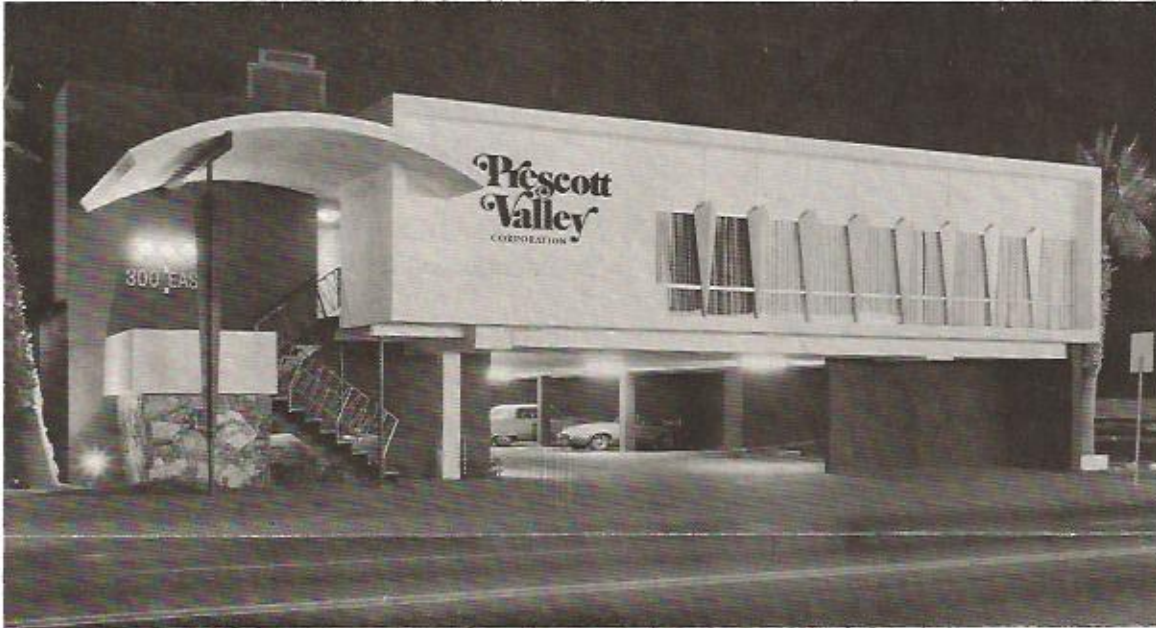
Illustration at left depicts the best reason we can think of to wake up in the morning and really enjoy the thought of going to work.

Our beautiful new offices at 300 East Camelback Road in Phoenix, Arizona provide an atmosphere of unparalleled beauty as a setting for the burgeoning growth and whirlwind of activity presently being enjoyed by our fine company.