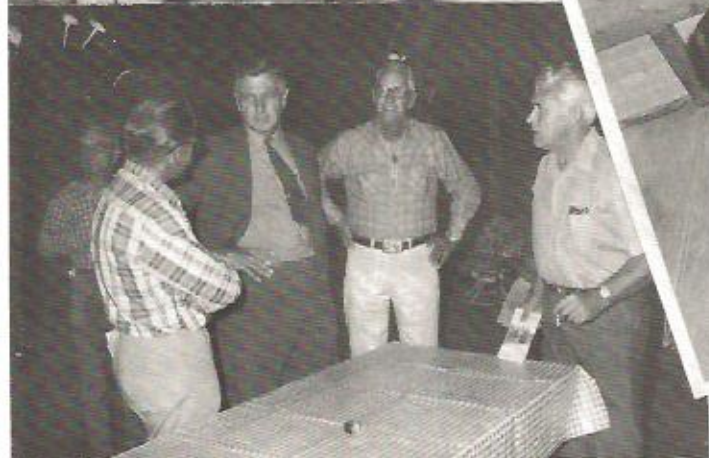
THE BUILDING BOOM CONTINUES