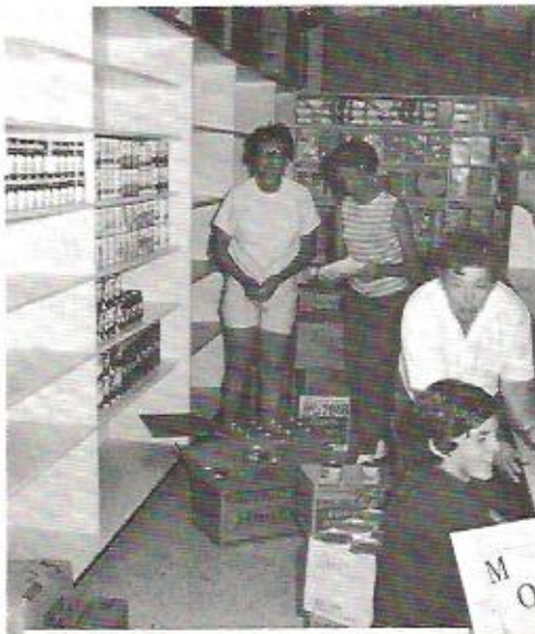
BUSINESS IS BETTER THAN WE EXPECTED!