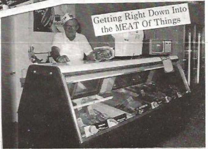
Getting Right Down Into the MEAT Of Things