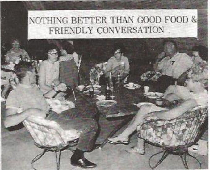
NOTHING BETTER THAN GOOD FOOD & FRIENDLY CONVERSATION