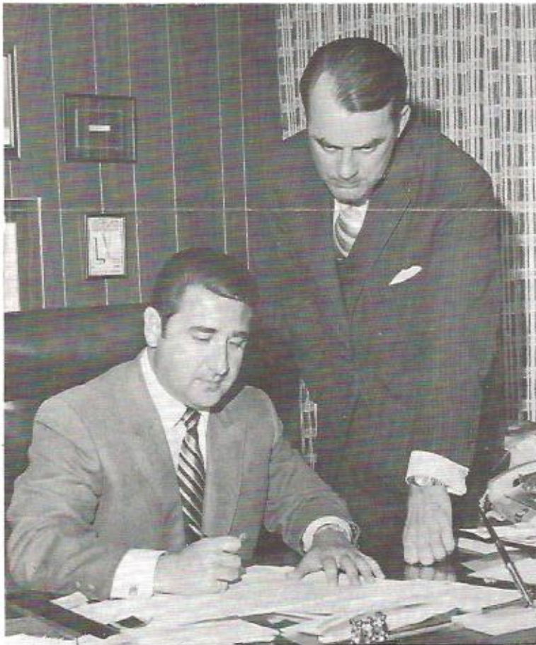
PRESCOTT VALLEY ACQUIRES WORLD-FAMOUS INTERNATIONAL PUBLISHING COMPANY