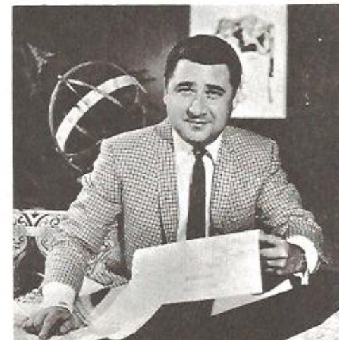
Chairman of the Board