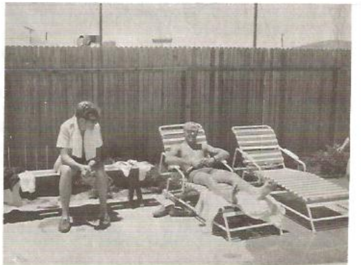
IT'S BEEN A "FUN" SUMMER FOR PV'S YOUNG FOLKS AT PRESCOTT VALLEY'S COMMUNITY POOL