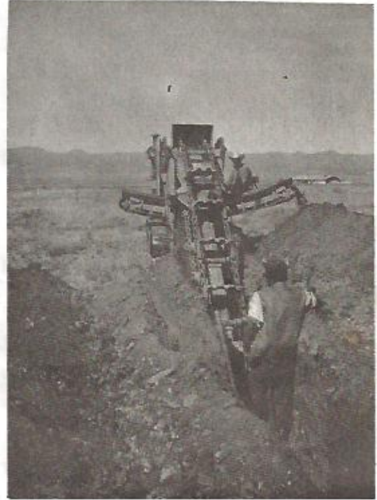
June 12, 1969

The colorful backdrop includes Mingus Mountain and the Victor Mead home.