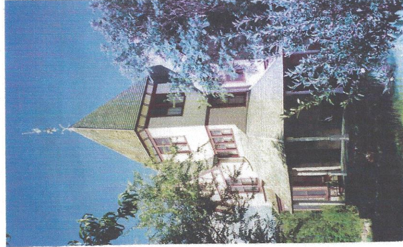
"The Castle" at Fair Park

Join and become a part of your town's growth.